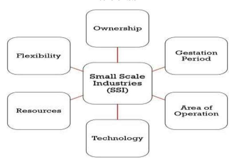
Role of SSI