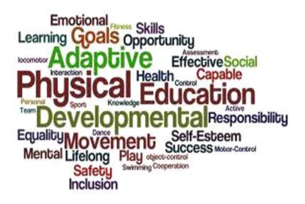
Fig: 1. Physical Education

Furthermore, it is critical to recognise that the impact of contemporary vs traditional PE varies according to cultural, regional, and individual characteristics. What works well in one situation may not work as well in another. As a result, when it comes to student wellbeing and mental health, a one-size-fits-all strategy is not appropriate.