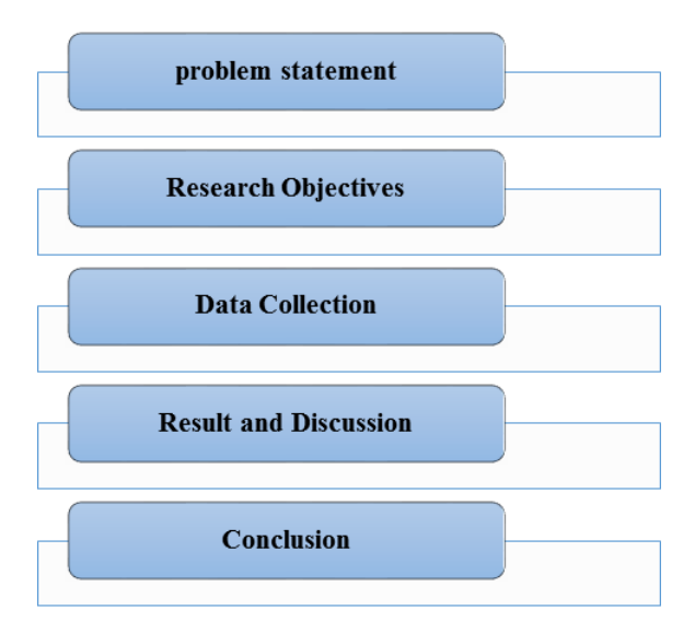
Fig: 6. Flowchart

In the study investigating "The Influence of Modern Physical Education Versus Traditional Approaches on Student Well-Being and Mental Health," the authors employed a mixed-method research approach. By merging quantitative and qualitative data, this strategy was selected to give a full knowledge of the issue.