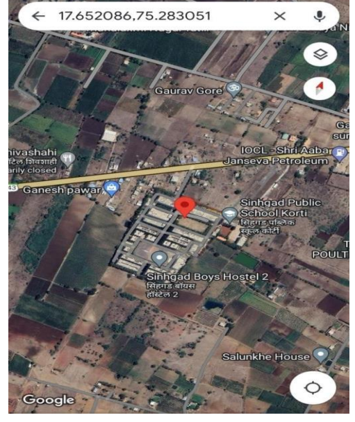
Fig2: GPS Location on map