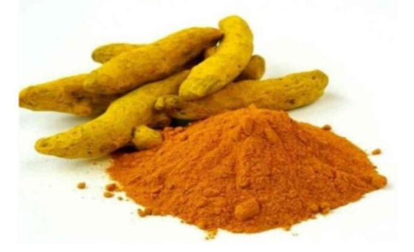
Figure 3: Rhizomes of Curcuma Longa and Powder Turmeric