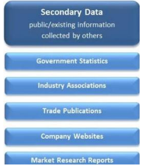
Figure 2: Secondary Data collection Technique

Methodology played an important role in the outcome of the research process. Methodology mainly includes four factors of research Philosophy, Approach, Design, and Data collection and analysis. For this research positivism, philosophy has been selected as a research philosophy. The reason behind selection it provides positive belief in the research that helps the researcher to conduct the research more effectively. The deductive approach descriptive design have been selected as research approach and research design in this study. Descriptive research design described all important information of the research that helps the researcher in the decision-making process (Mohajan 25). Another side, the Deductive approach deletes irrelevant information from the research which reduces the research time the researcher. Along with this, the secondary data collection process has been selected as a data collection method.