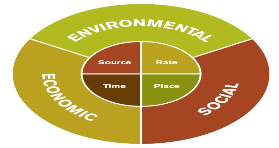
Figure 1: The 4R Nutrient Stewardship concept defines the right source, rate, time, and place for fertilizer application as those producing the economic, social, and environmental outcomes desired by all stakeholders to the plant ecosystem.

According to Mitscherlich (1909), the dose as the amount of nutrition rises, the growth rate and yields rise, but at decreasing rates.Consequently, using the suggested nutrients in a range of overlapping split doses different crops' nutritional requirementsIt's vital to gain developmental periods.greater uptake of nutrients and cane yield. To get the desired yield, it is important to have information on the number of nutrients (right rate) to be fertigated and applied. The notion applying the appropriate rate is supplying sufficient nutrients for production quality crop objectives (Hochmuth et al., 2014). Overfertilization can occasionally lead to both poison the crop and pollute the basement water.