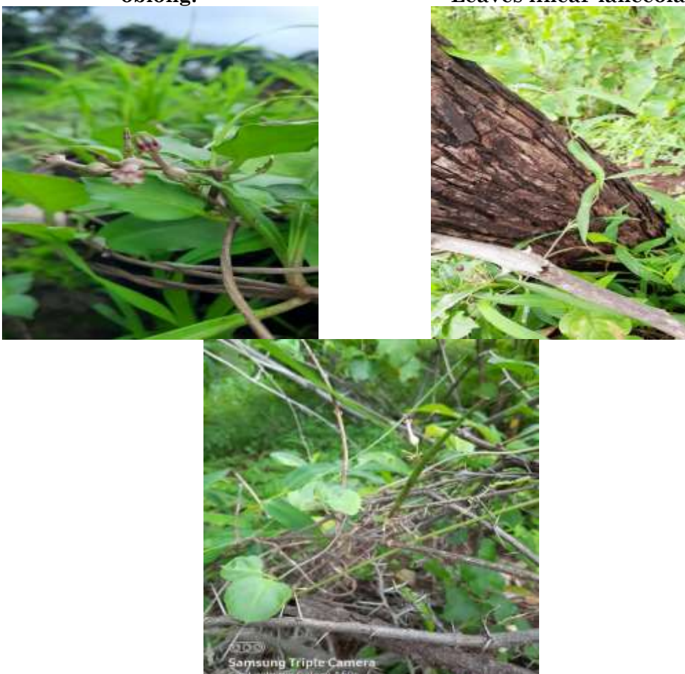
Fig. 3 - Ceropegia bulbosa Pod

Leaves lower ovate, those about middle ovate to lanceolate, those near upper end lanceolate, acute and Pod are cylindrical long.