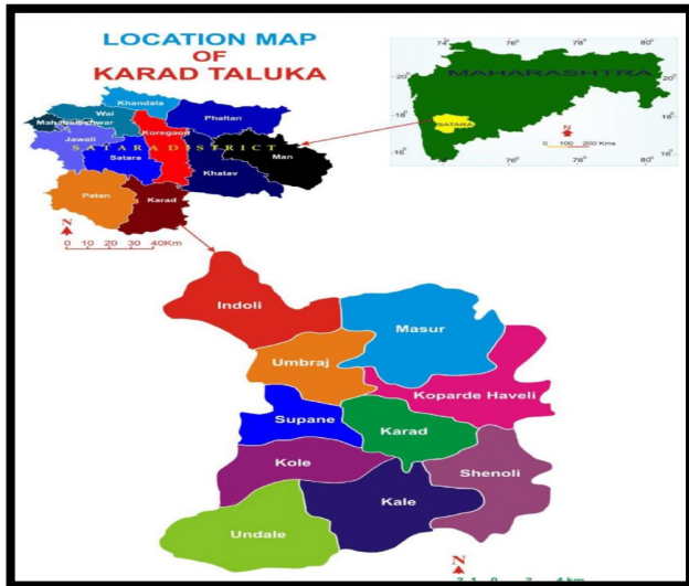
Fig 1: Location Map of Karad taluka

Its physical setting, availability of educational institutions, medical facilities, and industrial activities have encouraged population inflow from nearby rural regions.