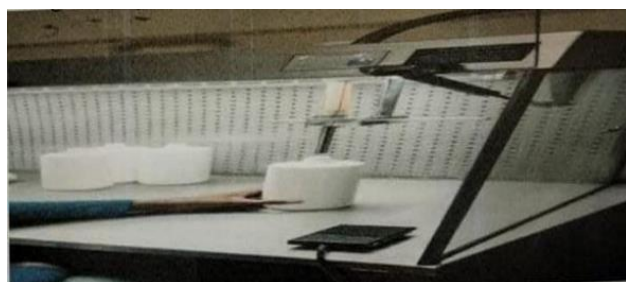
Figure 3. Packaging and Labeling of Liquid Biofertilizer in the Bottle

Label includes product name, target crops, viable cell count, batch number, manufacturing and expiry date and storage instructions.