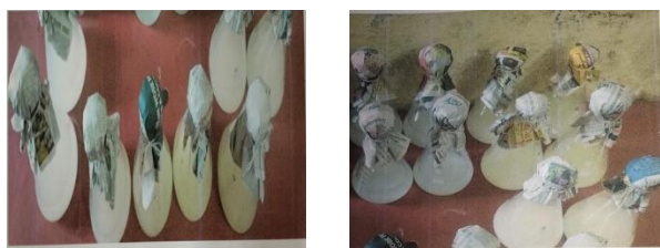
Figure 1. Inoculum media of Azotobacter sp. and Acetobacter sp.