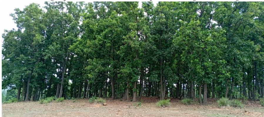
Sacred grove of Shorea robusta

Photograph of some medicinal plants are given in Fig.