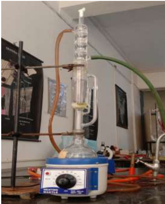
Fig.3-Soxhlet Extraction Apparatus