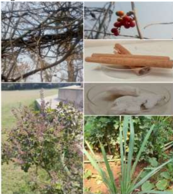
Fig.1a-stem of T. cordifolia; 1b-fruit T.cordifolia; 1c-Cinnamon; 1d-Tulsi; 1e-ginger; 1f-lemmon grass.