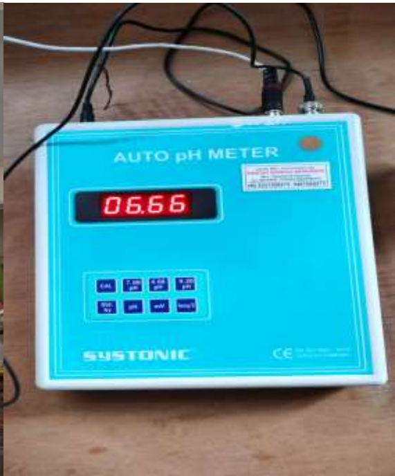
Fig.4- pH meter