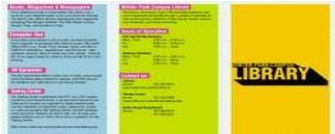
Fig. 1 Library broacher in print format

library brochures. Mostly the library brochures are available in print form and are as shown in Fig.1 (1)