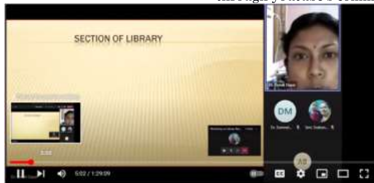
Introductory Lecture on Library Resources through Digital Era